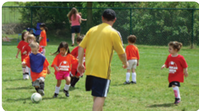
Youth soccer at Foglia YMCA.