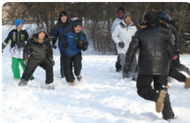
Snow football at Winter Camp, YMCA Camp MacLean.