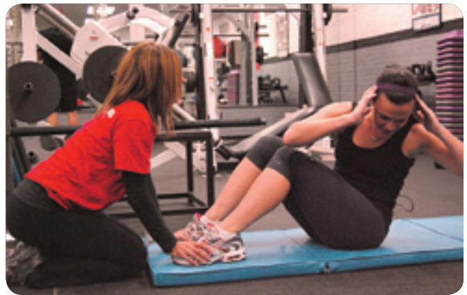
Personal fitness, personal training at Lake View YMCA.