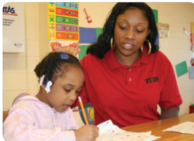
Homework help as part of the Y's Community Schools Initiative.