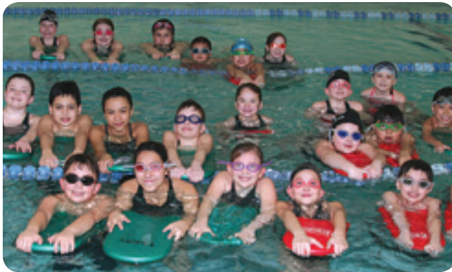
Swim practice at the Irving Park YMCA.