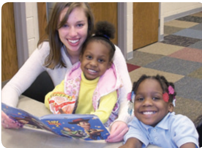
Reading together at Kelly Hall YMCA.