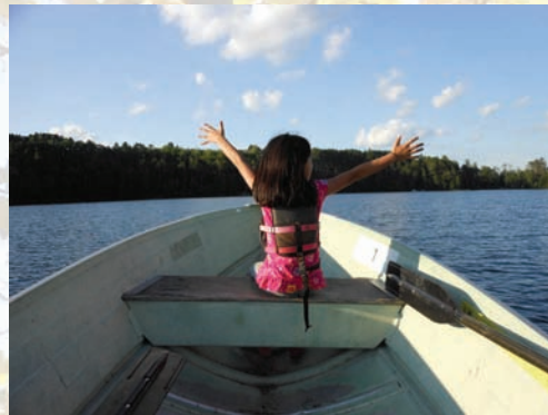
"Queen of the Wooooooorld!"

It's important that I continue to thank the Nawakwa advisory board of directors for all their dedication and generous support for leading the "Nawakwa Family Camp