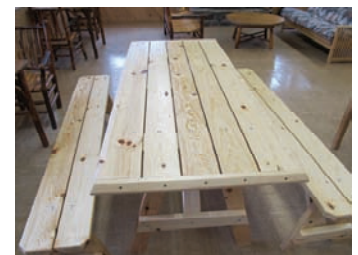
New Tables in Every Cabin