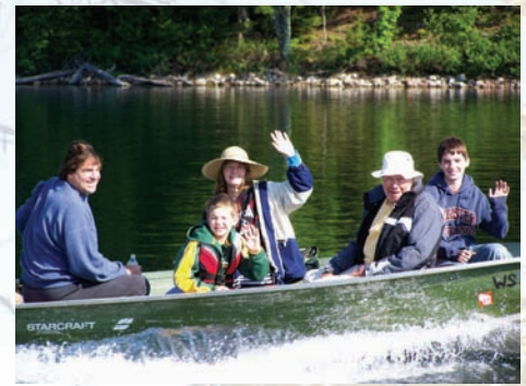
"We'll be Back for Dinner"