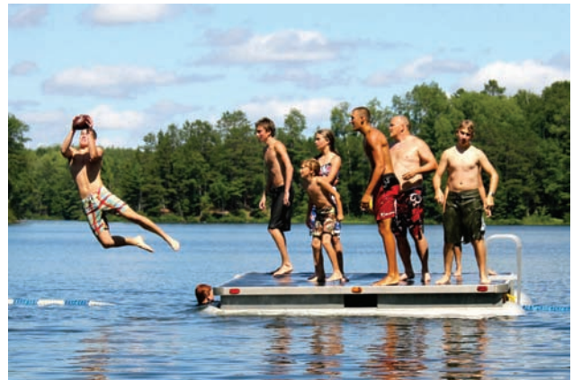
"The Chicago Bears in Training"