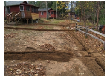
New Water Lines

Chicago Metro has been investing funds back into the association centers and camps. These funds have been used to improve the condition of the facilities and grounds. By the summer of 2012 Camp Nawakwa will have completed the following improvements. (Five cabin remodeled, new main water lines, several new roofs, new kitchen tables, new furniture in many cabins, new windows in many cabins, new mattresses in every cabin, new piers throughout camp)