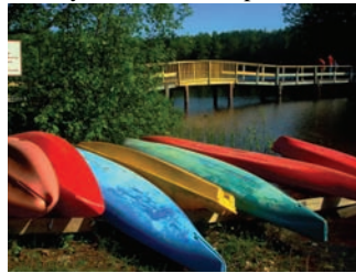
Early Morning at Nawakwa

Saturday, February 25, 2012, Camp Nawakwa will host its 5th annual Lac du Flambeau family fun day. In 2011, over 300 participants participated in the day's events. This event is a continued collaborative effort to give back to the local community. Call the camp office to help volunteer for this event.