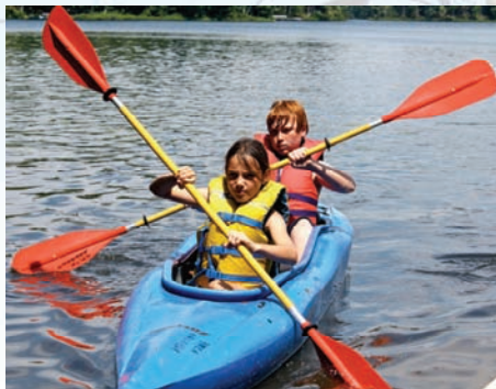
"Steer to the Right!"