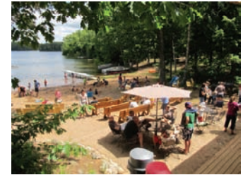
A Day at the Beach