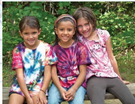
"We Don't Want to go Home"